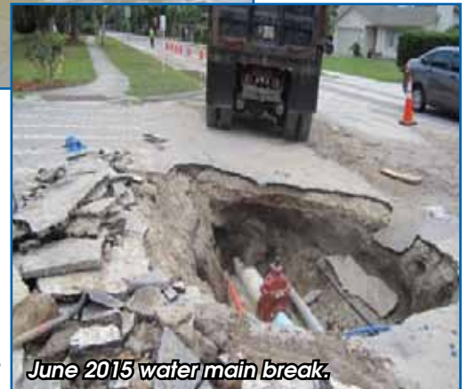
June 2015 water main break.

and into the storm drains. Again, the County was alerted by BLPA Members to protect the lakes involved. Although the County responded quickly, they originally assumed the turbid water had flushed into retention pond 1 at Cub Lake. Regrettably, the muddy water entered through the bypass