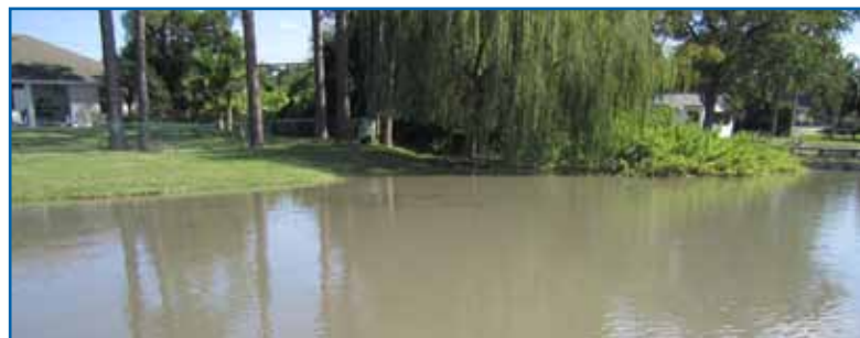
October 2011, 500' Plume in Bear Lake from water main break.

Fast forward to the early hours of June 3, 2015, another 10" water main break happened south of the same area above, at Saint Andrew's Church on Bear Lake Road. It was a large wash out of mud onto the streets