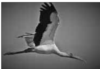
Wood Stork in Flight

A frequent visitor around the Bear Lakes is the Wood Stork, about the size of a Great Blue Heron. Although it's not the most attractive of birds, it's enjoyable to watch one move slowly and gracefully through shallow waters feeding on fish, crayfish, snakes, frogs, and hatchling alligators. It has a long neck and a huge white body with black wing tip feathers. Adult Wood