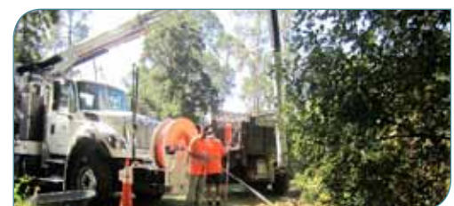
County vacuum truck hauls off heavy eelgrass loads.