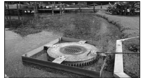
High water elevation able to flow out to Cub Lake after volunteers worked so hard and cleared the way!

debris, thereby creating dangerous swimming and boating conditions. In addition, you should always be on the lookout for any floating debris, normally found on shorelines or on docks around the Bear Lakes.