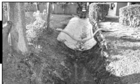
Grass mats protect the lakes from mud, sediments and pollutants washing in.