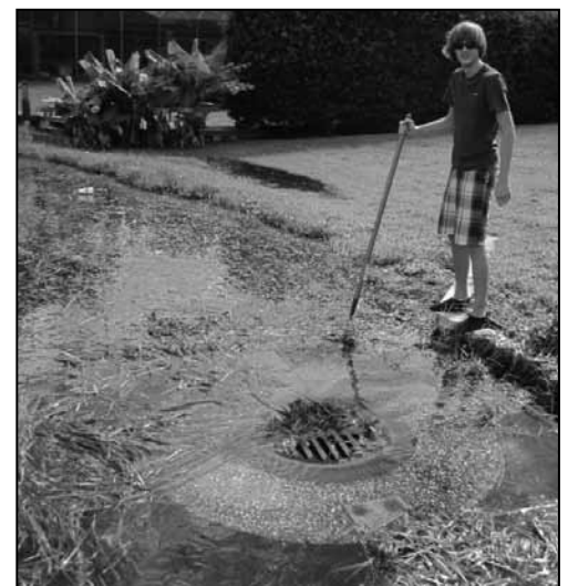
BLPA Members and residents volunteer to clear the drain so the elevated water can flow out to Cub Lake.

As of September/October 2014, the Bear Lakes' levels are as follows: Asher 105.78, Bear 103.50, Little Bear 102.78, and Cub 101.8. These high lake levels have submerged some docks and are over some seawalls. The Bear Lake Preservation Association (BLPA) would like to remind its members that high water levels may hide submerged docks, tree limbs, and other