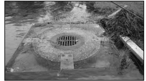
The drain located on the southeast corner of Bear Lake collects floating eelgrass and plugs the flow of elevated water out to Cub Lake.