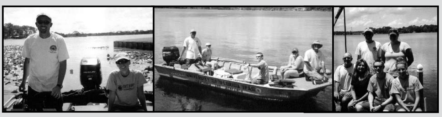
On June 22, 2006, the LAKEWATCH experts conducted our 3rd vegetation study in 15 years on Bear Lake. The lake has less than 1% area covered (PAC) and percent volume inhabited (PIV).