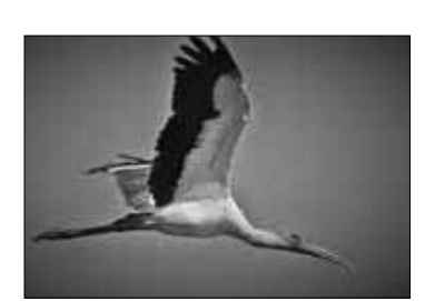
Wood Stork in Flight

A frequent visitor around the Bear Lakes is the Wood Stork, about the size of a Great Blue Heron. Although it's not the most attractive of birds, it's enjoyable to watch one move slowly and gracefully through shallow waters feeding on fish, crayfish, snakes, frogs, and hatchling alligators. It has a long neck and a huge white body with black wing tip feathers. Adult Wood