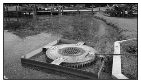
High water elevation able to flow out to Cub Lake after volunteers worked so hard and cleared the way!

debris, thereby creating dangerous swimming and boating conditions. In addition, you should always be on the lookout for any floating debris, normally found on shorelines or on docks around the Bear Lakes.