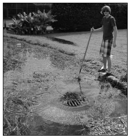
BLPA Members and residents volunteer to clear the drain so the elevated water can flow out to Cub Lake.

As of September/October 2014, the Bear Lakes' levels are as follows: Asher 105.78, Bear 103.50, Little Bear 102.78, and Cub 101.8. These high lake levels have submerged some docks and are over some seawalls. The Bear Lake Preservation Association (BLPA) would like to remind its members that high water levels may hide submerged docks, tree limbs, and other