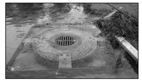
The drain located on the southeast corner of Bear Lake collects floating eelgrass and plugs the flow of elevated water out to Cub Lake.