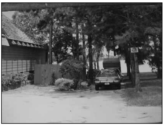
We posted a sign for "No Lake Access."

balloons pass over our treetops and across the lake early in the morning, a seaplane landing in the lake, or an ultra light plane circling the lake. We are now retired and live in a cabin in the mountains of East Tennessee. Our adult children are now carrying on the circle of life with our nine arandchildren.