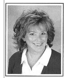
Owned And Operated By NRT Incorporated.

We come to you Boats, Jet Skis and Accessories