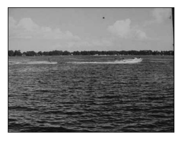
Notice all the trees! a typical look around the lake in the 1970's. The trees absorbed nutrients from fertilizers, pollutants & septic tanks, now many have been removed for better views.

There were many happy times, like taking our pontoon boat out to the middle of the lake to have a picnic, watching hot air