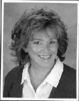
Owned And Operated By NRT Incorporated.