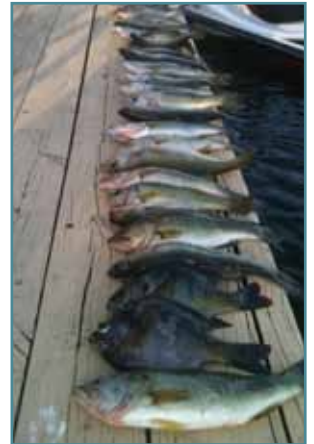
FISH TOO BIG FOR BIRDS TO SWALLOW.

When the bird is through fishing, they will perch themselves somewhere under the hot Florida sun drying their wings. This is necessary since their wings are not waterproof, which gives them more speed when under the water.