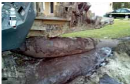
Pipe Boring Rig & 16" installation or highly treated sewer water polluting our rivers.

When the Sanlando/Wekiva Wastewater Treatment Plant Operating Permit was renewed, the amount of discharge to Sweetwater Creek was limited by 2/3rds and they mandated lower total nitrogen limits. This should tell you something about reclaimed (reuse) water,