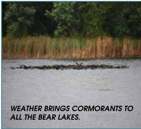
WEATHER BRINGS CORMORANTS TO ALL THE BEAR LAKES.

If you were home on March 4, 2013, no doubt you watched the visiting Cormorants fly in. They seemed to just keep coming until we lost count. They were followed by a few visiting sea gulls.