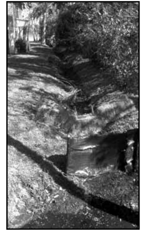
Hay and silt barriers placed in ditch for filtering.

BLPA has learned Utilities Incorporated will own and maintain the pipe after the construction is completed. The emergency number for pipe leaks, pipe breaks, etc. for this 16" pipe on Balmy Beach Drive is: 1-800-272-1919. SAVE THE WEKIWA – SAVE THE BEAR LAKES!