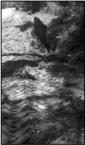
Dirt exposed and ready to fall in ditch to Bear Lake.

to the first ditch leading directly to Bear Lake. See picture left showing dirt exposed and ready to fall in ditch to Bear Lake.